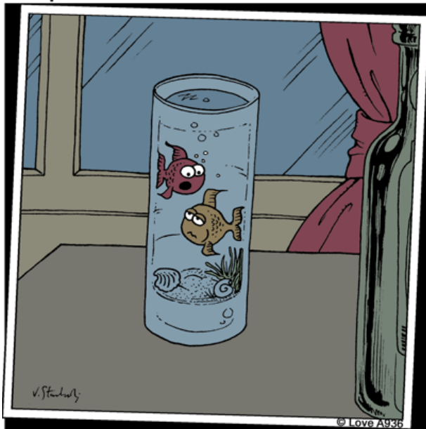
"Think he'll ever spring for a bowl?"