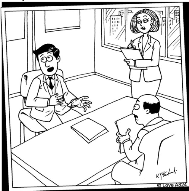
"Oh, a drug test. That's a relief. I thought you were going to test my ethics."