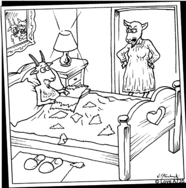
"I buy you a book to help our marriage, and what do you do? You eat it."