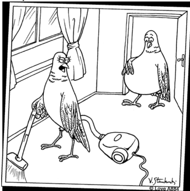
"Hangin' around McDonald's again, aren't you?"

Weekly funny... Snapshots at jasonlove.com