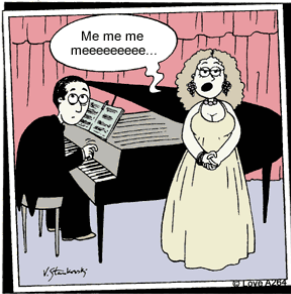
How singers become self-centered.