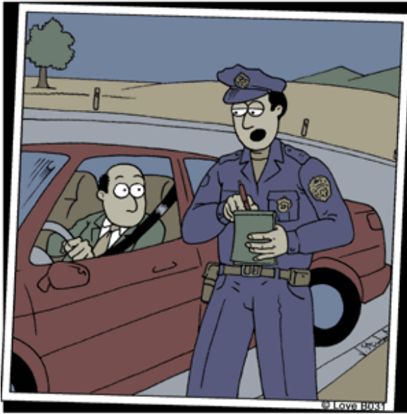
"So if I'm hearing you correctly, you drive over broken yellow lines pretending that you're Pac-Man..."