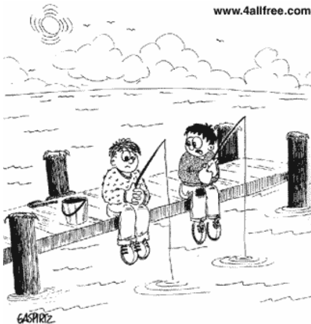
See? Not even the fish like brussel sprouts.