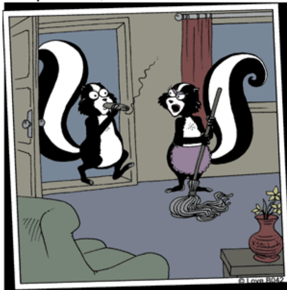
"Take that thing outside. As if we don't stink enough."