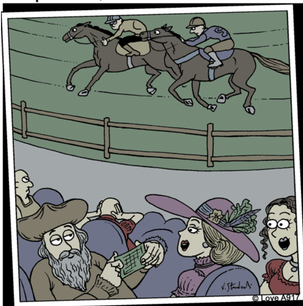
Before becoming the legend that he is today, Nostradamus first enjoyed a pretty good living at the tracks.