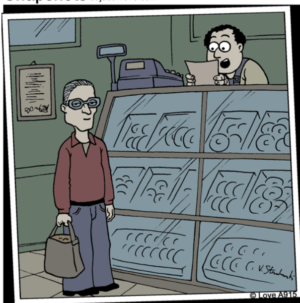
"Let's see. Seuss ... Seuss ... Here we go. That's a medium box of bagels and lox and a pop on the rocks by seven o' clock."