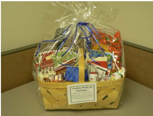
Getting Ready for Christmas donated by Goddard Library

Proceeds benefit the SSSP Iris Fried Scholarship December 5, 2007 ~ CF206/208 11:30 a.m. - 1:00 p.m.