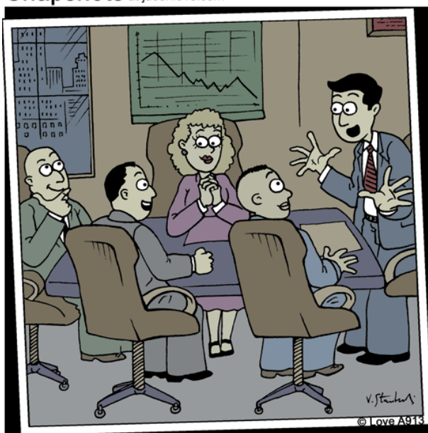
"I know: What if we take that old 'got milk' slogan, but instead of using the word 'milk,' we'll insert the name of our own product."