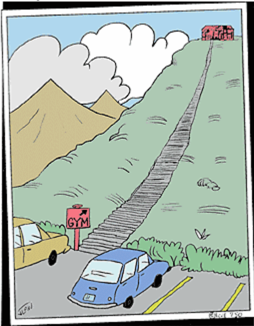
A gym that doesn't need Stairmasters.