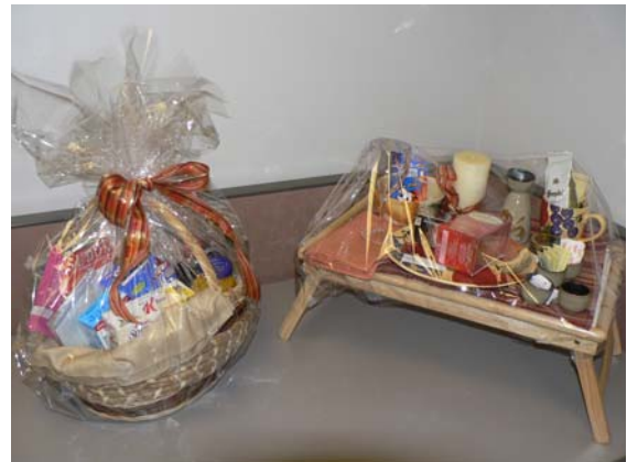
Breakfast in Bed, donated by the RCTC Business Office, 2006

• Winning basket: $80 for "Night Out" donated by the Counseling/Advising Center staff