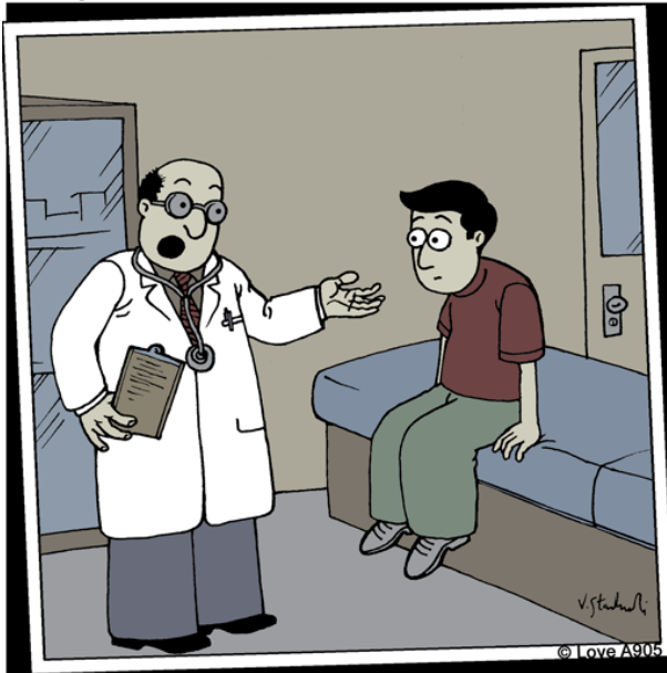
"A second opinion? All right, but I charge double for that."