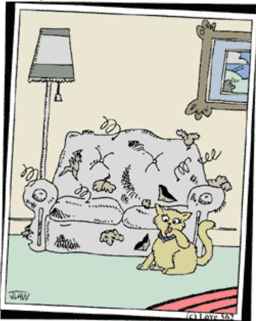
$600 scratch post.