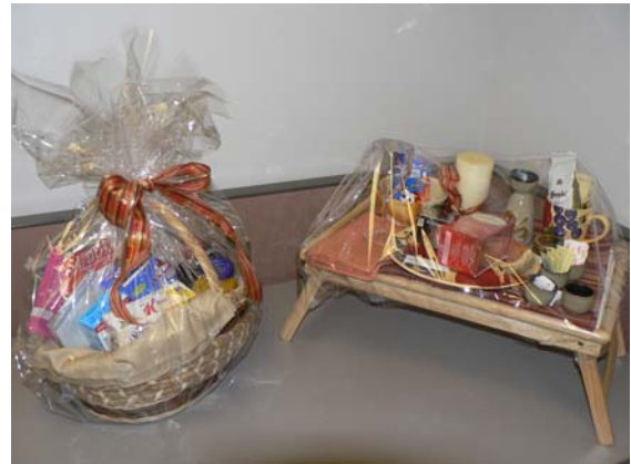
Breakfast in Bed, donated by the RCTC Business Office, 2006

Winning basket: $80 for "Night Out" donated by the Counseling/Advising Center staff