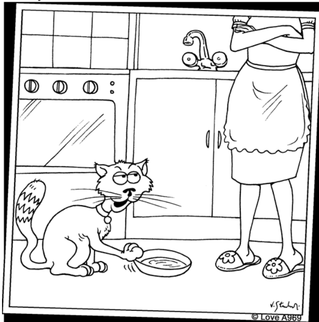
"Tap water?! As if."